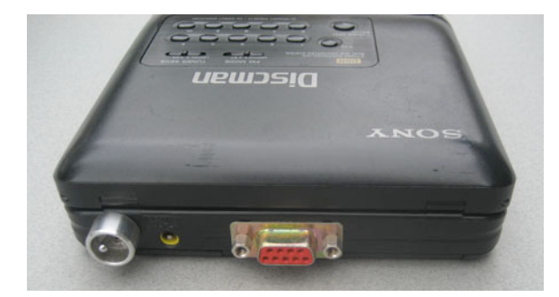
Figure 4: Modified Sony DT66 (my favorite player, quite rare), showing switch for mute enable/disable, and D9 connector for controlling player from a computer.

models, and substitutions oftentimes significantly changed the character of a work. Unfortunately, with each "improvement" that Sony introduced to their product line (especially in the areas of error correction and "shock" protection) the glitch artifacts grew milder, and the general trend toward integration of more functions on fewer discrete ICs made it increasingly difficult to defeat the mute function. Accordingly, as time went by I was driven to seek out obsolete models, and my instruments became more anachronistic, where once they had seemed so modern.