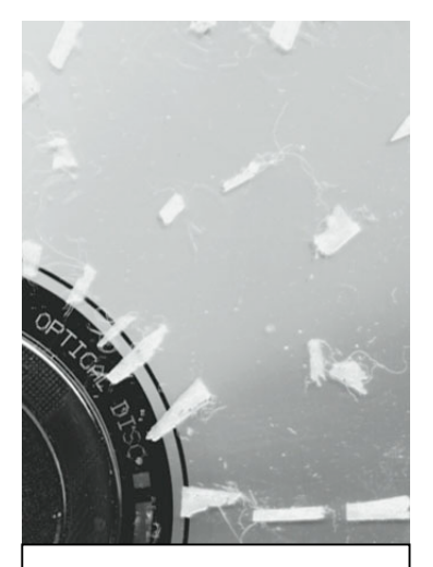
Figure 1: "Wounded CD" by Yasunao Tone.

Yasunao Tone was the first composer I heard making use of CDs – for his Solo for Wounded CD (1985) he selectively damaged the discs with strips of Scotch tape, unleashing a torrent of glitches that resulted from overloading the digital error correction system<sup>4</sup>. Once loaded into the player, a CD basically played itself, jumping from one location to another in response to the patterns of damage to its surface; Tone used the >>| and |<< controls to nudge the player in one direction or the other, but the system had a mind of its own, and the composer's control was indirect at best. I loved the sound -- the odd juxtaposition of ultra-hi-fi recordings with the harsh digital errors – but I wanted to control the player more directly, ideally approximating turntable techniques such as scratching