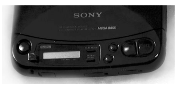
Figure 3: Detail of modified Sony D121. The small switch to left of display cuts the speed in half.

slow sections in a multi-movement piece). The skip rate, tempo irregularities, degree of swing, and amount of glitchiness all vary considerably from player to player. Searching for the mute signal in one player I tapped a test-probe to a pin on a chip and was rewarded by the CD slowing to half-speed and all the sounds dropping an octave in pitch – a feature seemingly exclusive to this one model (D121). I designed most of my pieces around the behavior of specific