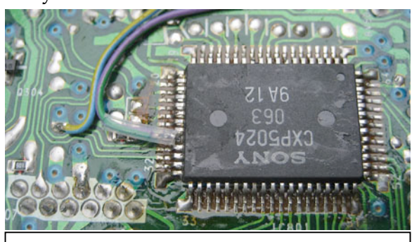
Figure 2: Lifted "mute" pin on chip in Sony D2 Discman (wires go to switch for mute enable/disable.)

flow of the signal upstream to its point of origin, a pin on a large chip devoted to controlling the overall behavior of the player. With a soldering iron and a needle I disconnected the pin from the trace on the circuit board, which released a flood of hitherto unheard sounds: starting and stopping the disc was accompanied by a brief, loud squawk; pressing "next track" (>>1), especially in "shuffle" mode, evoked a needle being dragged violently across an LP, or John Zorn's furious stylistic jump-cutting<sup>5</sup>; "pause", by contrast, isolated short fragments of material from the CD in lilting loops.